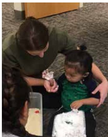
Planned giving helps change lives of children of all ages who are served by MSDB across the state of Montana.

I hope by this article to gives you all an idea of how easy and beneficial it can be to support our school through planned giving. I encourage you all to discuss any of these options with your professional advisors. If you need any assistance or have any questions concerning planned giving, please feel free to contact the Foundation office at (406) 771-6040, and we will assist you in any way that we can. Please remember MSDB Foundation in your wills and trusts. ■■