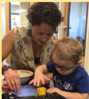
"Play with a purpose" promotes developmental milestone achievement.