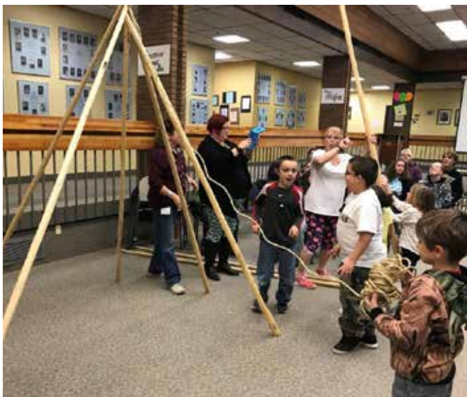
Students work together to construct a tepee during the National Native American Heritage celebrations.

Then, as a group, we put the tepee up in the common meeting area of the Bitterroot building on campus. The tepee will be moved to its new location by our dining room after the snow melts. It will be up until the end of November, which is National Native American Heritage Month. Thanks to all who helped out and supported this fun and educational week!!