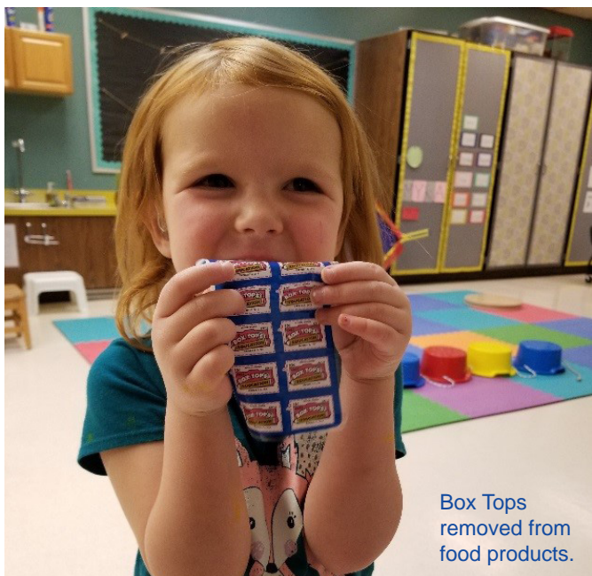
Box Tops removed from food products.