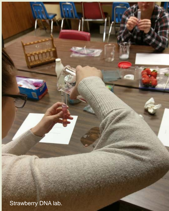
Strawberry DNA lab.

The look on the students' faces and the excitement in the air is something I will always remember. That is what makes working with kids worthwhile. ■■