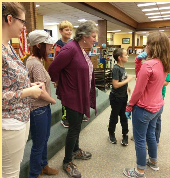
Arresting the guilty party.

This activity encouraged communication, problem solving, teamwork, and critical thinking. The students really had a great time and the staff did too!! What a great way learn while having fun! ■■