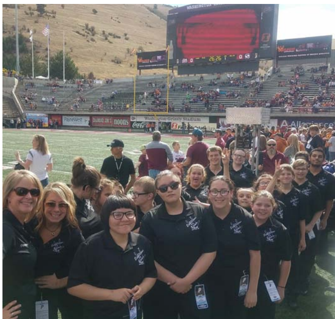
Expressions of Silence in the Washington Grizzly Stadium in Missoula.