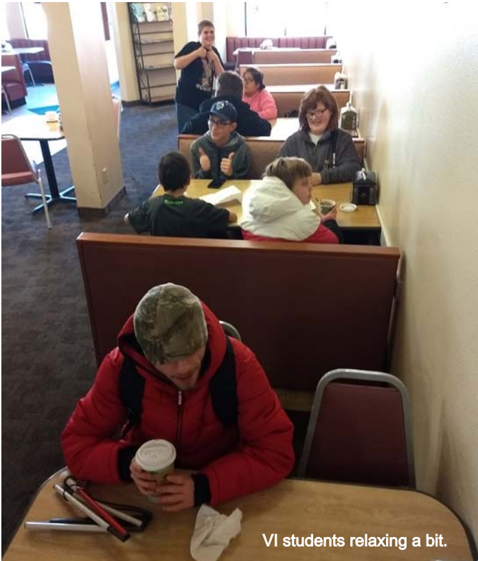
VI students relaxing a bit.

W hite Cane Day is celebrated on MSDB's campus each year in mid-October in a variety of ways. This year, the Visually Impaired Department went all out to inform people across our campus and in the community about the independence of people with visual impairments.