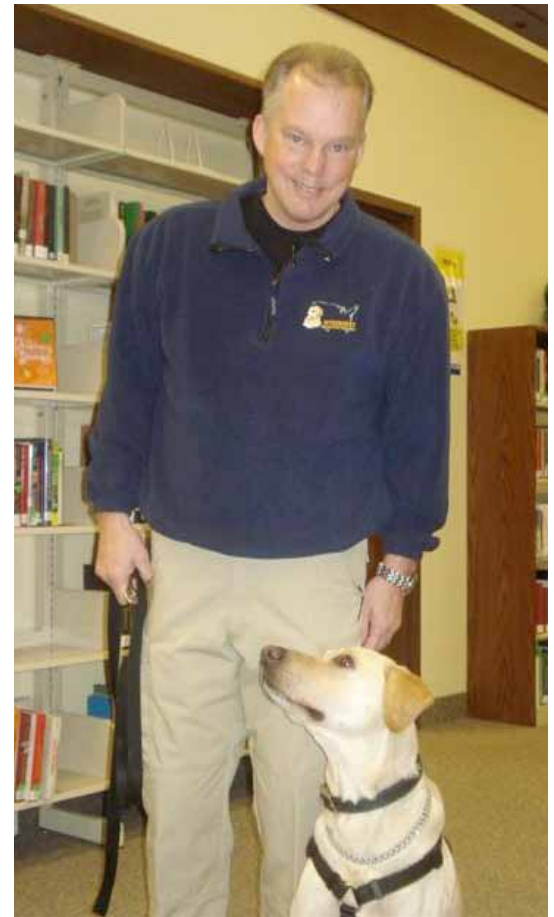
“Champ” really lives up to his name. This team can’t be beat. Thanks for helping to keep our school safe.

Since hiring Interquest Detection Canines about six years ago the unannounced inspections have yielded zero serious contraband. The “hits” have been on a jacket (recently used during a weekend hunting trip), some face acne wash (contains alcohol), one .22 shell (located in a storage room amongst some donated rags) and a beer bottle cap (found in a box of match box cars, probably being used as a prop!). We work hard to keep our campus safe and the folks at Interquest assist us in doing so. Awareness is a key to safety. Prevention in this instance is in the interest of the well being of our students and staff. The staff of Interquest will provide MSDB staff and students with educational information on drug abuse and measures to keep safe while at school and at home. ■■