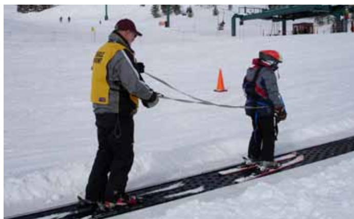
LEFT: An Eagle Mount volunteer uses a harness and tethers to help guide a student who is visually impaired.