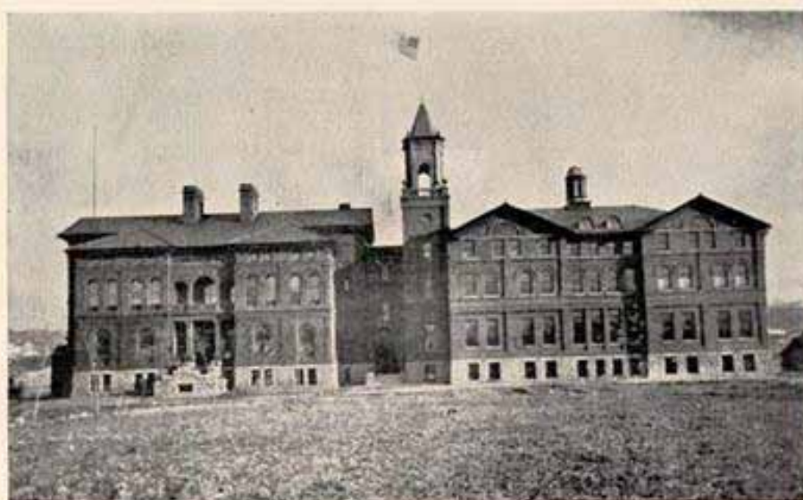
MSDB's original school building when it was in Boulder, MT, in 1902.

instruments you don't know how to play. You are told to play them to "entertain" an intolerant crowd, which ridicules you. Luckily, one compassionate observer does not think this display is entertaining. Valentin Haüy happens to be eating lunch at a café and your embarrassment becomes his inspiration for establishing the first school for the blind. In 1786, Haüy opens the Institute for Blind Youth in Paris. Attending this school as a child with blindness, you are given an education in reading, writing, music, and vocational skills. Rather than being a beggar, you gain