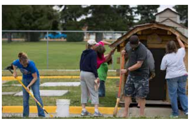
Staff members came together to do their part to help make a safer and more beautiful playground for the students.