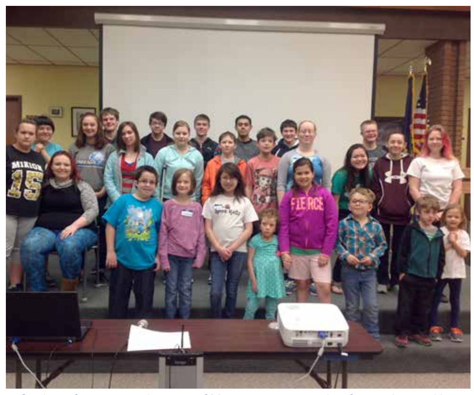
Students from across the state of Montana came together for another exciting Deaf Enrichment Weekend!

After dinner, the students were divided into age groups. We filled the gym playing games like Red Light, Green Light and Duck, Duck, Goose. We also spent time getting to know each other. The kids loved it! Next we filled the children with snacks galore. Cotton Candy is a must at every DEW event. Then we sent them back to the cottage for a good night's sleep before rousing them in the morning for a fun filled day.