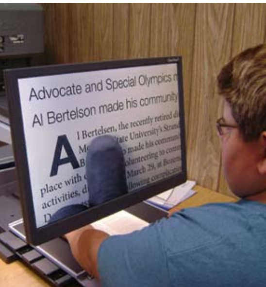
Top: Reading a magazine with the FarView Portable CCTV.