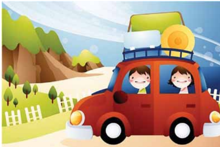
MSDB: Supports families by giving students more opportunities to travel home.

When speaking to families about the current travel arrangement, kids traveling home once “every couple of weeks” sounds a whole lot better than “just once a month.” The school staff and families are grateful to the MSDB Foundation for making this change possible. ■■