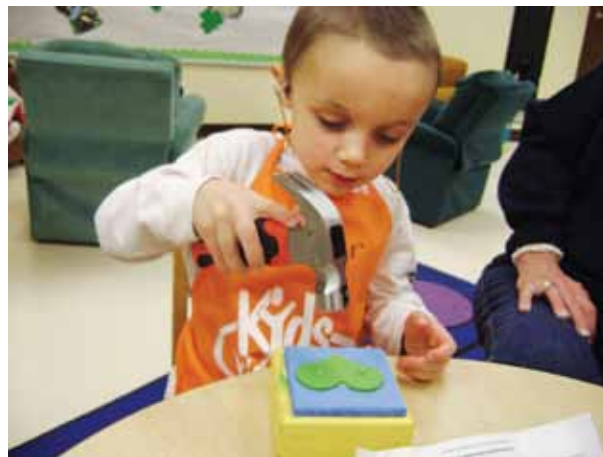
Thank you Home Depot!

great pride in our accomplishments and get very excited to see what new project we get to start. ::