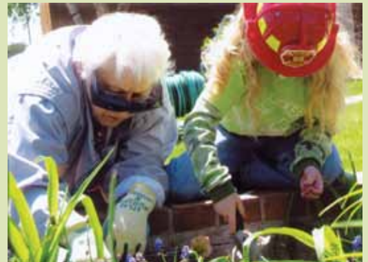
Volunteer & student helping MSDB "bloom".

The Rainbow Garden Club has been providing MSDB with flowers and more for over 25 years. Their annual contributions to MSDB include sending flower arrangements for the formal dinners at the cottage every Thanksgiving, Christmas and Easter. For Graduation they give us a beautiful centerpiece as well as corsages & boutonnieres for each graduating senior. They also clean out our planters and then return to help our students plant flowers in the spring time. MSDB sincerely appreciates the generosity and support of this wonderful community group. ❖