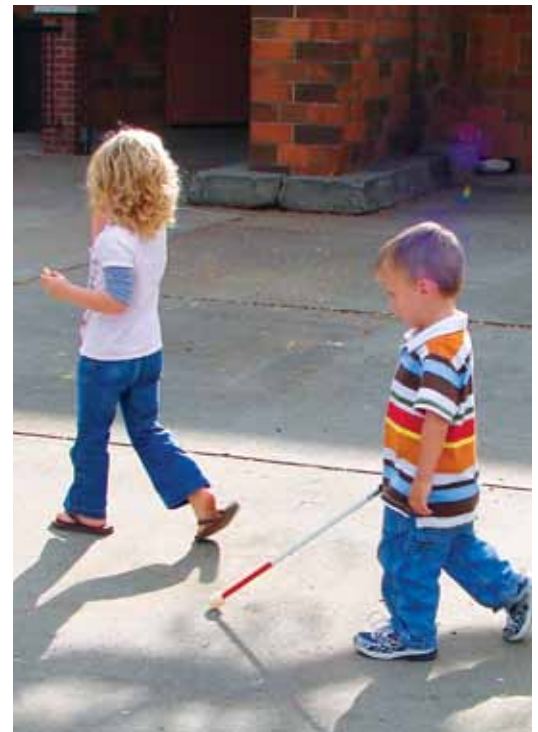
Yellowstone County students had fun participating in White Cane Day festivities.

A great time was had by all who attended the 2010 White Cane Day celebration in Billings. The afternoon was filled with fun and games and several group walks around Rimrock Mall. Young and old had the opportunity to walk and talk together, using either white canes or guide dogs. Toddlers and a MSU college student joined retired folks and school age children in the festivities. Parents had the opportunity to meet one another and visit while their children bumped and pushed balloons and balls, played pin the tail on the donkey or had their faces painted. Many thanks to the Billings Crime Prevention Center, to Rimrock Mall for their hospitality and to Party America and City Brew for providing treats and all the things that made our celebration super festive! ■■